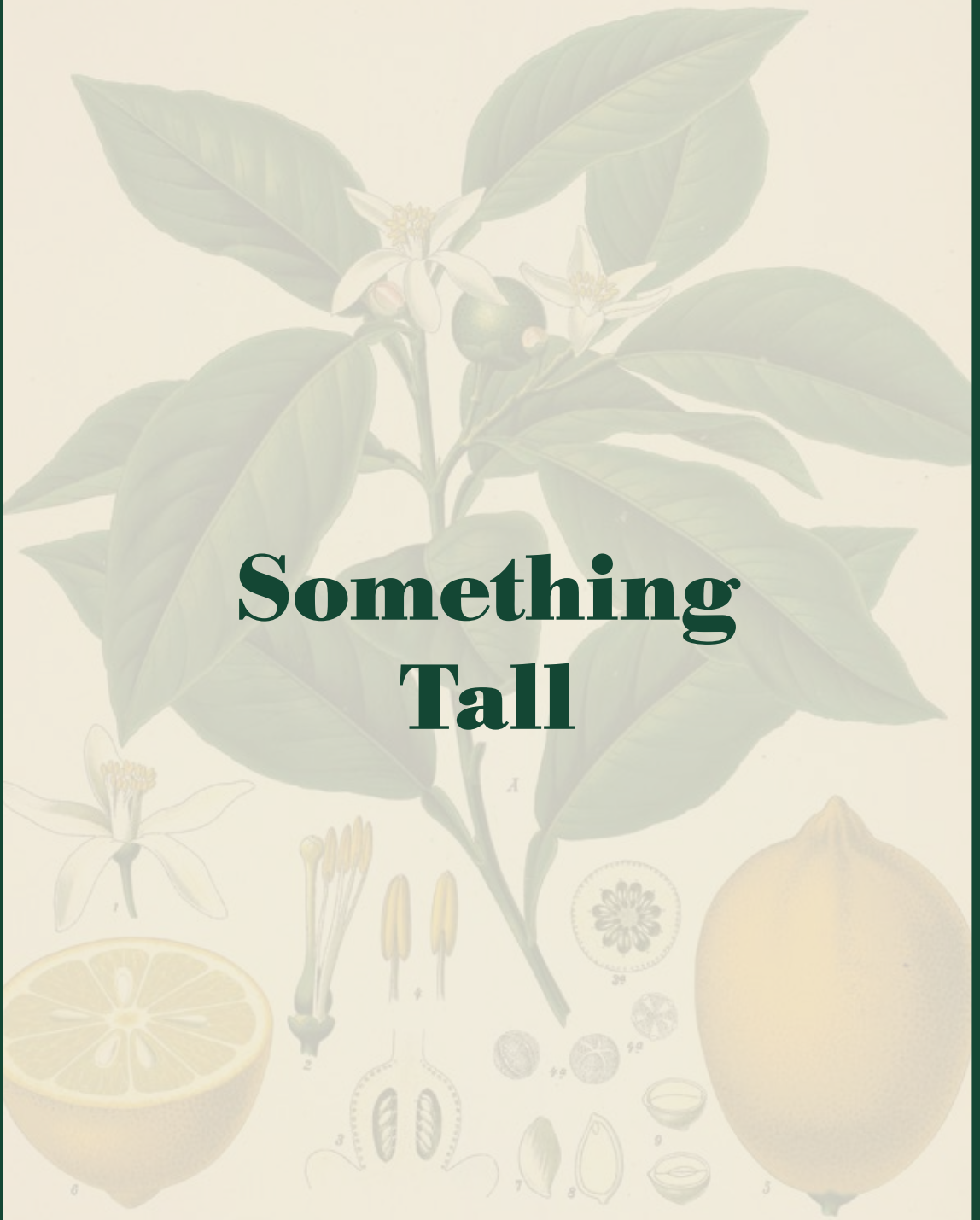
Citrus Limonum Riess.